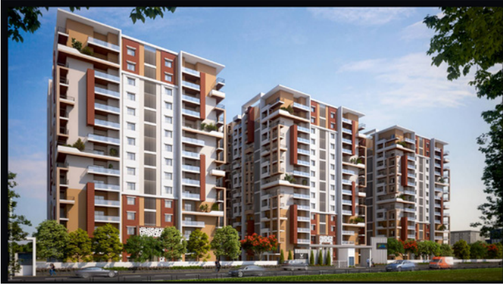
Vasavi Lake City, Hafeezpet