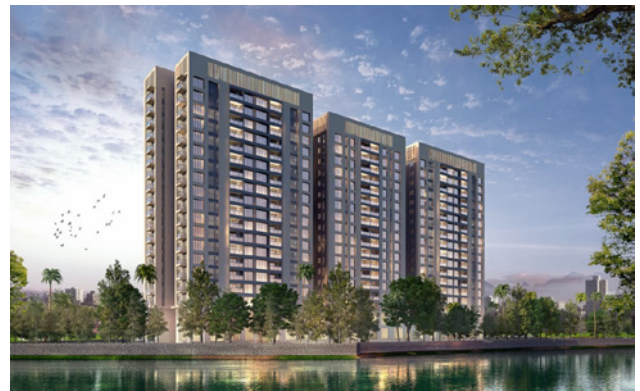
Newyork by Manjeera, Bangalore