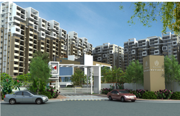
Manjeera Monarch, Vijayawada