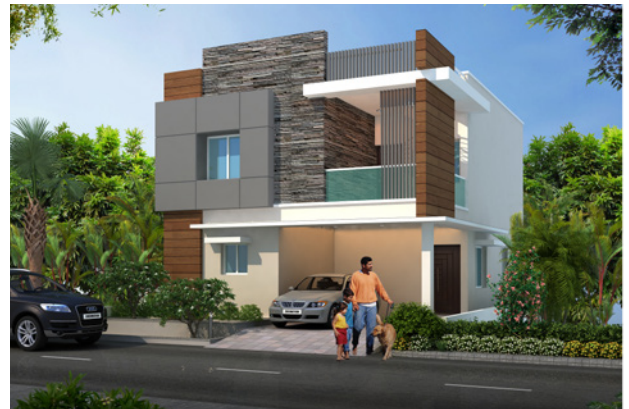
Manjeera Blue, Ongole