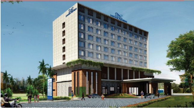
Manjeera Sarovar Premier Hotel